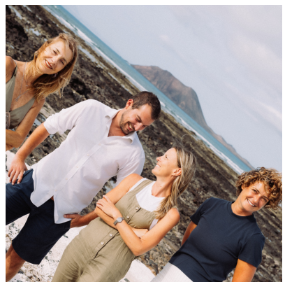
Your Contact for this Property: KaZa Hogar