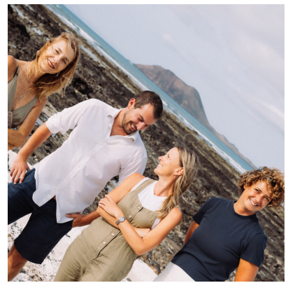
Your Contact for this Property: KaZa Hogar