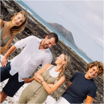
Your Contact for this Property: KaZa Hogar